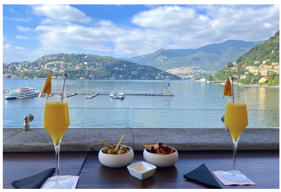
A stunning Lake Como view from the Vista Palazzo

An overnight stay at five-star <u>Vista Palazzo</u> is an aristocratic immersion. Its 18 palatial guest rooms and suites are lavishly decorated with Dedar fabrics, Italian marble and soaking tubs. Guests are personally pampered by butler Alberto, who presents perks like a pillow menu. There's a welcome drop in room rates during low season.