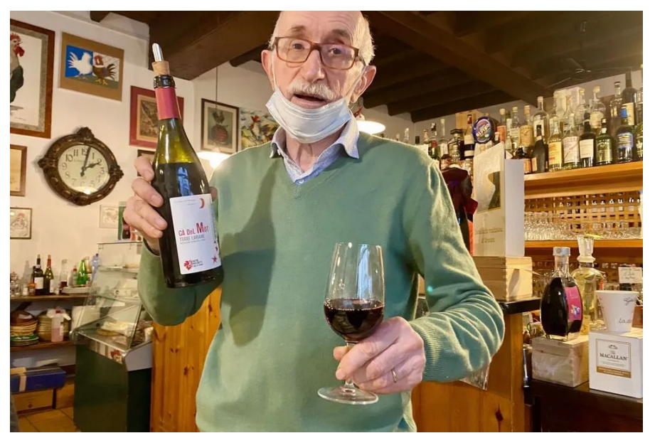
Osteria del Gallo's owner freely pours local wine