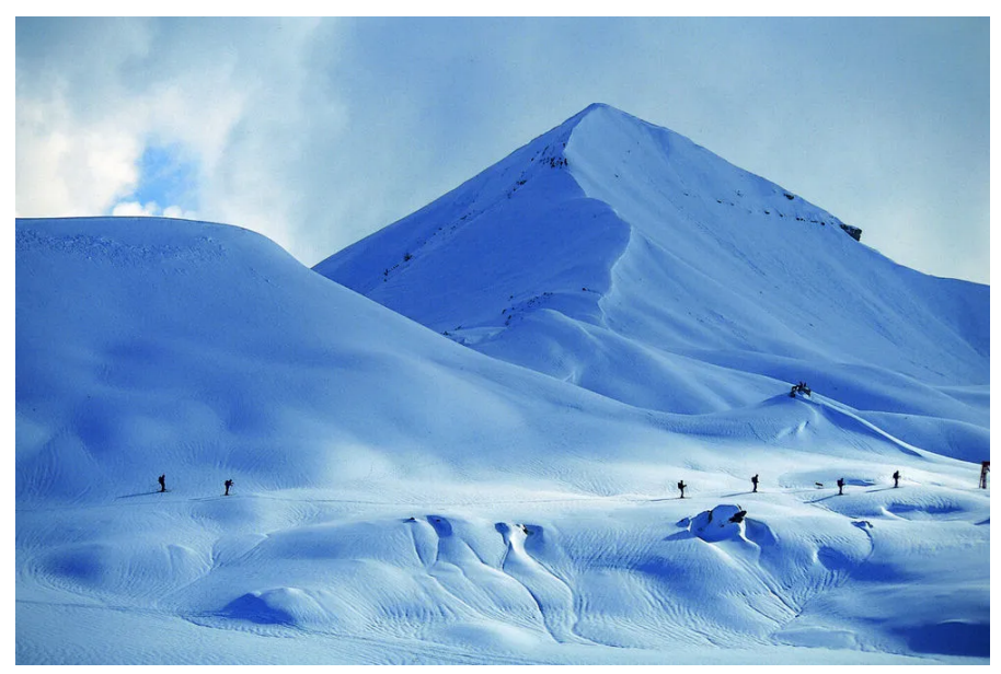
Deep snow in Piani di Artavaggio