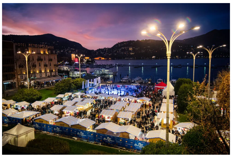
Como's Christmas Market

From late November until January 6th, Como hosts <u>Città dei Balocchi</u>, an Old World Christmas Market. Buildings and monuments are illuminated with twinkling lights, hot mulled wine perfumes the air and live music rings out. An ice skating rink adds festive fun, food stalls offer the opportunity to sample traditional delicacies and handmade crafts present a fine excuse to shop.