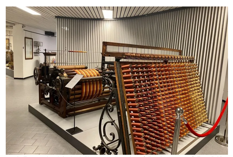
Como's silk museum is a window into its history as a major producer of silk

A century ago, Como's luxurious silk was in demand around the globe. A visit to the Museum of Silk highlights Como's historic and pivotal role in silk manufacturing and trade. Visitors get an in-depth look at each stage of production, from silkworm rearing to loom weaving to finished fabric samples, as well as an understanding of the impact this industry had on Como's economic and social development.