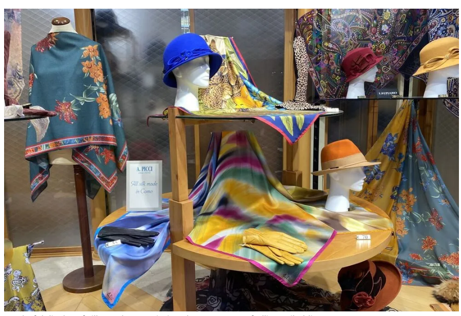
A colorful display of silk goods at A. Picci

Como was once a major producer of silk. Today, production has migrated to nearby industrial areas, though a small amount of high-quality silk is still produced here. Family-owned A. Picci is boutique in the heart of town. One glance at its colorful window display of scarves, ties and assorted accessories crafted from Como silk, and it will take willpower to resist making a purchase.