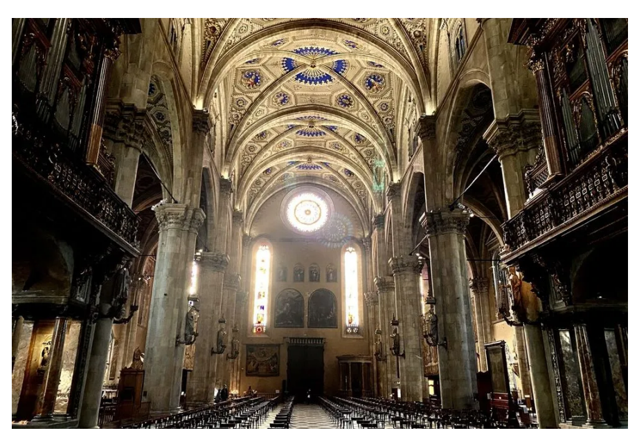
Como's Cathedral is an eye-catching blend of eclectic styles

Explore Como's Old Town, its pedestrian-only cobblestone streets lined with retail shops and restaurants. Marvel at <u>Cathedral Santa Maria Assunta</u>, built starting in 1396 and taking over 300 years to complete. One of the most eye-catching cathedrals in Northern Italy, it's an eclectic mixture of Gothic, Renaissance and Baroque styles with an imposing dome, precious tapestries and an altar made of marble, onyx and bronze.