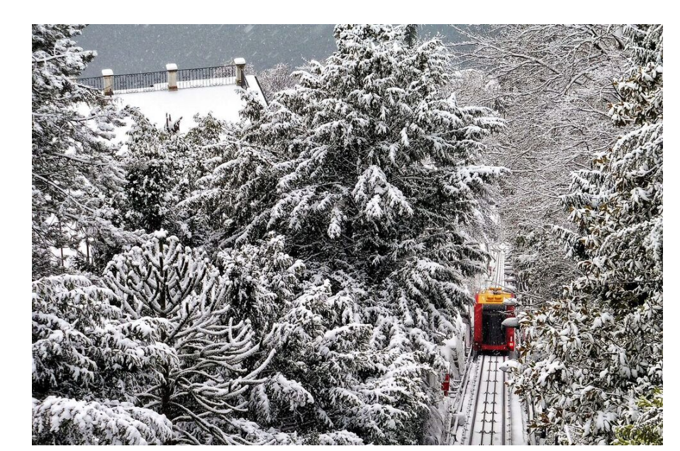
Ride the funicular to snowy Brunate

With an eyeful of dramatic scenery, riding the <u>funicular</u> up the steep mountainside to Brunate is an attraction in itself. It only takes seven minutes to arrive in this picturesque village with Liberty style architecture, a lighthouse and breathtaking views of Lake Como and the Alps. While it rarely dips below freezing lakeside, Brunate's elevated altitude brings a suggestive winter sprinkling of powdery white snow.